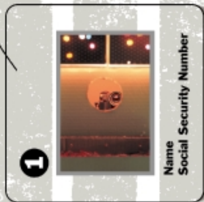
Illustration: Peter Velthuis

THESE TWO ASSIGNMENTS ARE REQUIRED AND MUST BE INCLUDED IN YOUR PORTFOLIO.