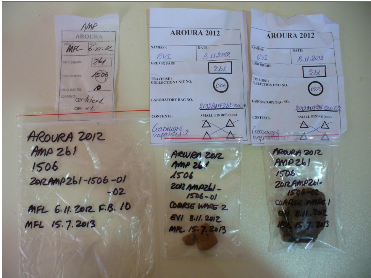
Figure 1. Bags of finds prepared with their new label, with older, preliminary material class and field bag labels above.