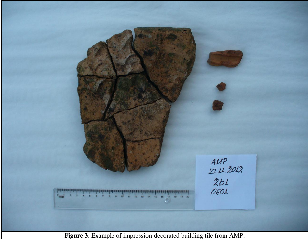
Figure 3. Example of impression-decorated building tile from AMP.