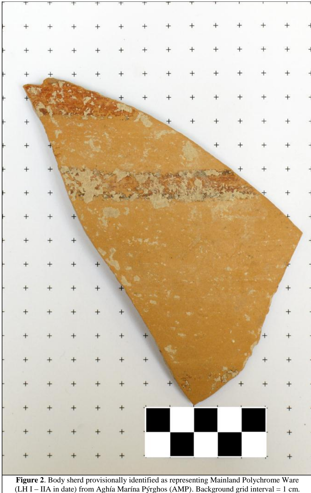
Figure 2. Body sherd provisionally identified as representing Mainland Polychrome Ware (LH I – IIA in date) from Aghía Marína Pýrghos (AMP). Background grid interval = 1 cm.